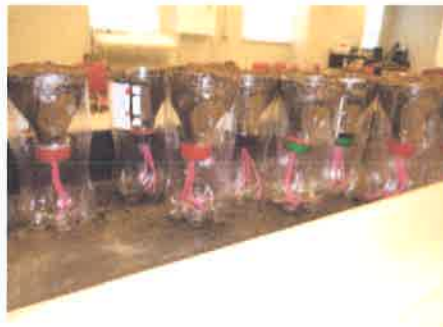
Figure 4. Soil is in place along with the wicking.