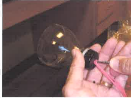
Figure 2. Feed mason twine through a small hole in the lid.