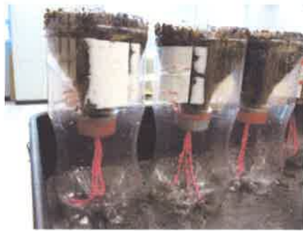
Figure 5. Mix fertilizer — one bottle cap of fertilizer in eight liters of water. Wet the soil gently until water drips from the wicks. Then fill the reservoirs with the dilute fertilizer solution. Plant the seeds carefully — about six to a bottle, uniformly spaced on the surface, not buried in the soil.