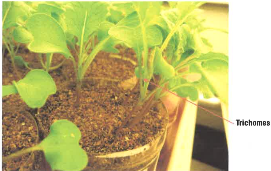
Figure 7. The plants here are 7–12 days old.

Step 4 Score each of your plants for the trait that your class chose to evaluate. You may need a magnifier to do this accurately. Don't be surprised if some plants are not very different from one another.