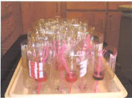
Figure 3. The growing systems are ready for planting.