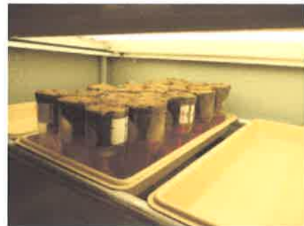
Figure 6. Cover with a light layer of vermiculite. Place the reservoirs — with fertilizer water, seeds on the surface of the soil, and a light layer of vermiculite on the soil — under the lights.

Step 2 Each day, check your plants and make sure that the reservoirs are full, especially on Fridays. These reservoirs have enough volume to last a three-day weekend for small plants.