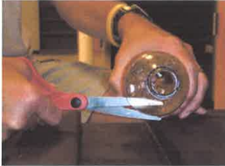
Figure 1. Notice that the scissors are cutting along the bottom of the bottle curve. This provides better control.

Step 1 Prepare growing containers. Go to the Wisconsin Fast Plants website and find the instructions for converting small soda bottles into planting containers ( http://www.fastplants.org/grow.lighting.bottle.php ). Plan to use one-liter bottles or smaller. You can raise up to 6 plants per container.