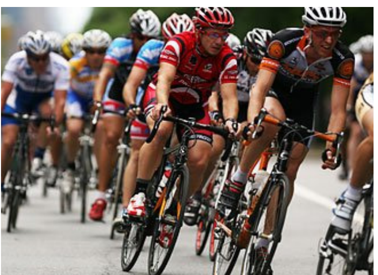
Bickers train to prepare for the unusual race.

is the meeting place by. "It's kind of the for this year's upcom- same thing, I guess. ing World Naked Bike They should proba-