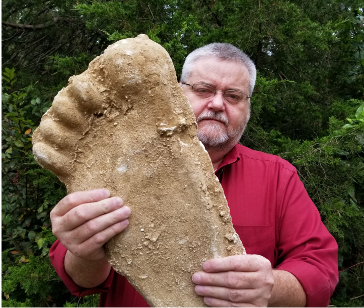
Man sculps bigfoot foot

The size of the footthey have all of the Variations on Bigfoot print is the equiva-Bigfoot sightings that have been spotted on lent to a US men's