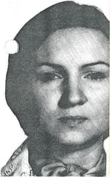
No widow's peak