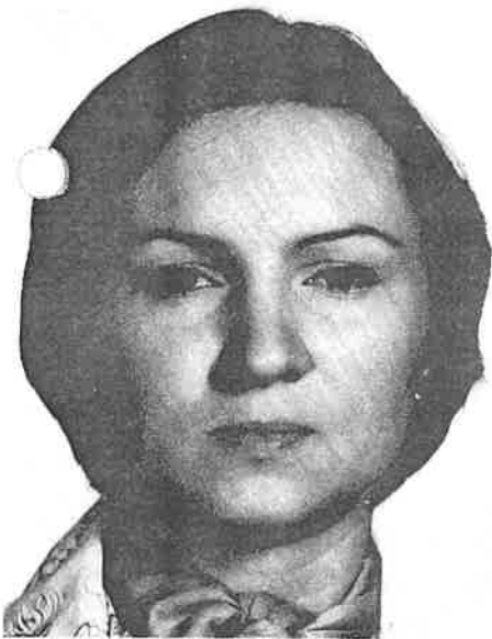
No widow's peak