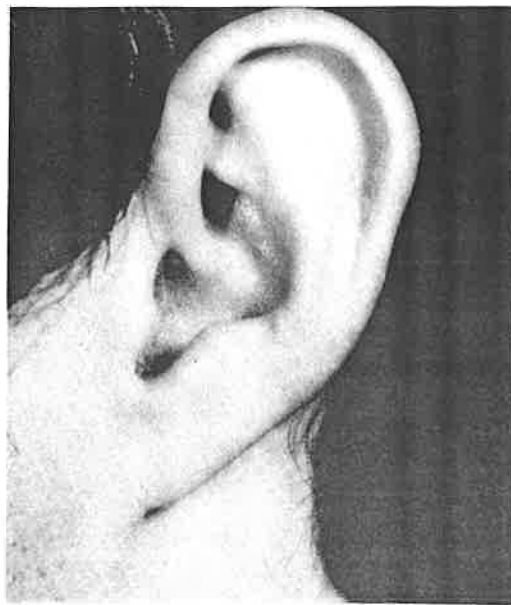
Attached ear lobe