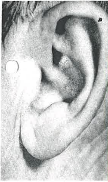
Free ear lobe