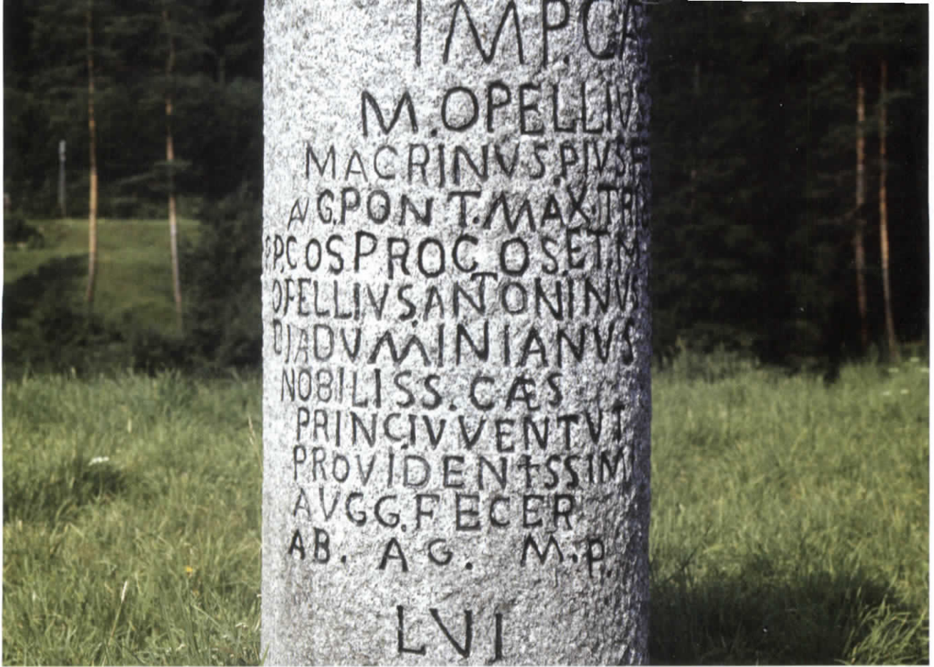
Romans wrote in all capital letters, as seen on this Roman distance marker from 217 C.E.