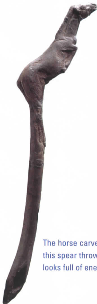
The horse carved on this spear thrower looks full of energy.