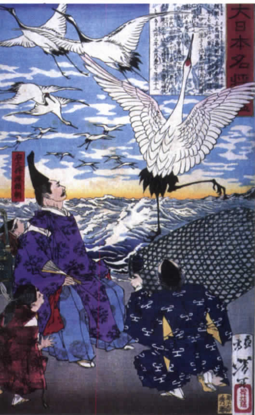
Minamoto Yoritomo, Japan's first shogun, liked to release wild cranes on the beach near his castle.