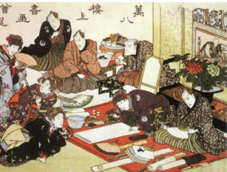
Samurai also were trained in the art of writing, or calligraphy.