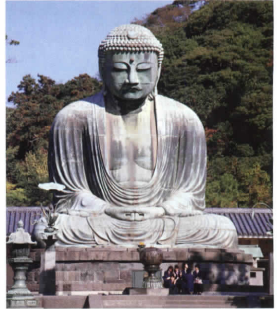
Many samurai believed in Amida Buddha, depicted in this statue.

Zen Buddhism was a good match for the samurai way of life. Zen helped samurai learn discipline, focus their minds, and overcome their fear of death.