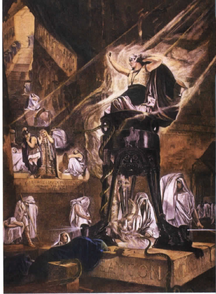
The oracle of Delphi sat on a three-legged stool as she listened for the voice of the god Apollo.

The Olympian gods were part of the everyday life of the ancient Greeks. People asked the gods for help when setting out on journeys by land or sea. They dedicated festivals and sporting events to them. They decorated their temples with images of the gods.