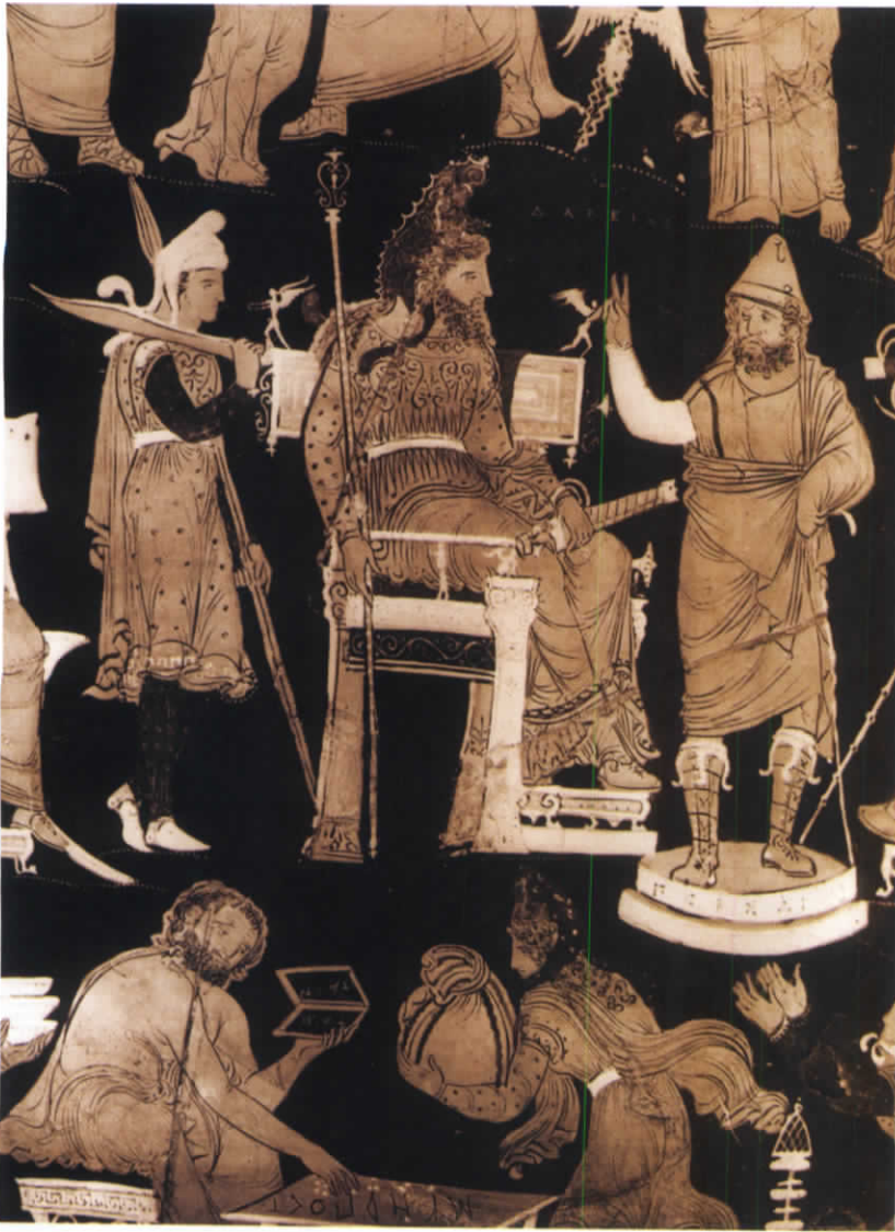
King Darius of Persia holding a council of war.

In 493 B.C.E., the Persian army defeated the Ionians. To punish the Ionians for rebelling, the Persians destroyed the city of Miletus. They may have sold some of its people into slavery.