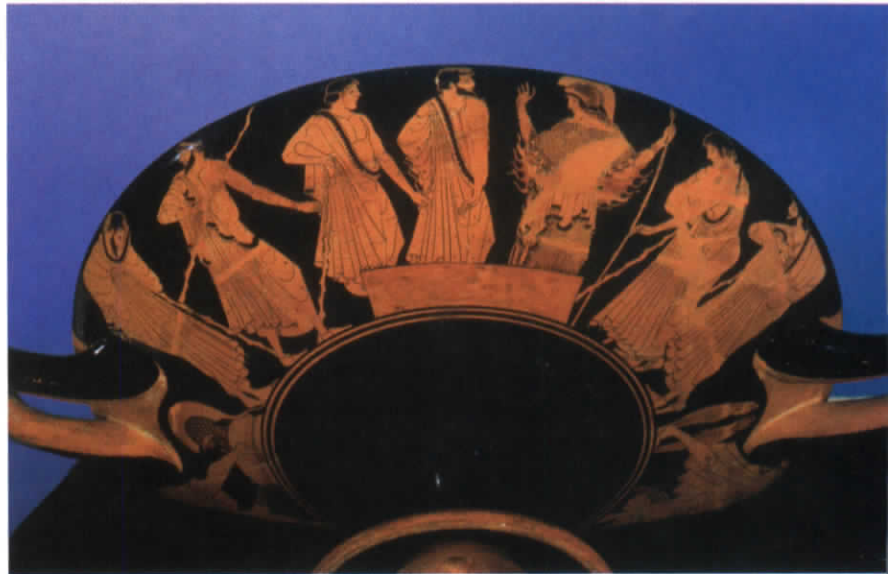
The painting on this piece of pottery shows Greek citizens casting votes in an election.

assembly a group of citizens in an ancient Greek democracy with the power to pass laws