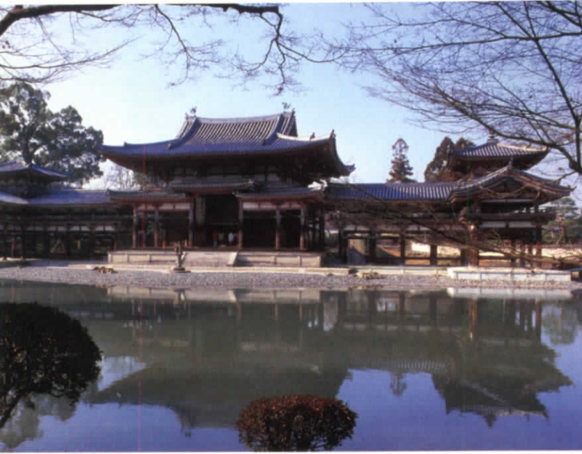
Phoenix Hall was once part of a grand temple near Heian-kyo.