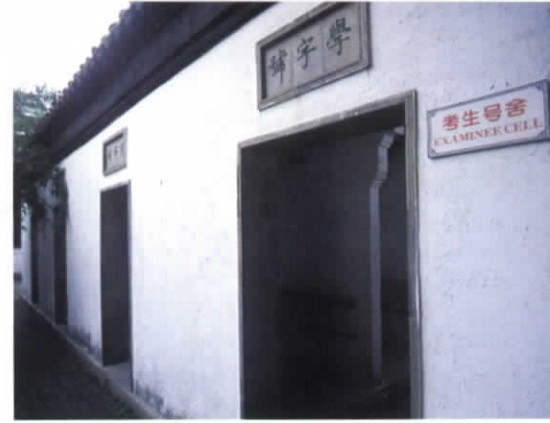
Civil service exams lasted for several days. Candidates were locked in small cells like these during the tests.

Yet China's civil service system may also have stood in the way of progress. The exams did not test understanding of science, mathematics, or engineering. People with such knowledge were therefore kept out of the government. Confucian scholars also had little respect for merchants, business, and trade. Confucians had often considered merchants to be the lowest class in society because they bought and sold things rather than producing useful items themselves. Under the Ming, this outlook dominated, and trade and business were not encouraged. In addition, the bureaucracy became set in its ways. Its inability to adapt contributed to the fall of the Ming in 1644.