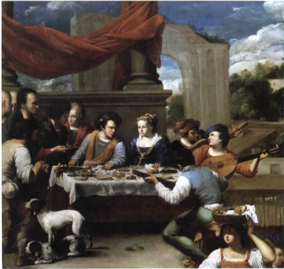
The Meal at the House of Epulone was painted by artist Carlo Saraceni around the year 1600. The family appears to be wealthy, with an outdoor space in which to gather and be entertained by lute players.

In general, people of the Middle Ages believed in an orderly society in which everyone knew their place. Most boys grew up to do the same work as their fathers. Some girls trained for a craft. But most girls married young, some as early as 12, and were soon raising children of their own. For many girls, their education was at home, where they learned cooking, cloth making, and other skills necessary to run a home and care for a family.