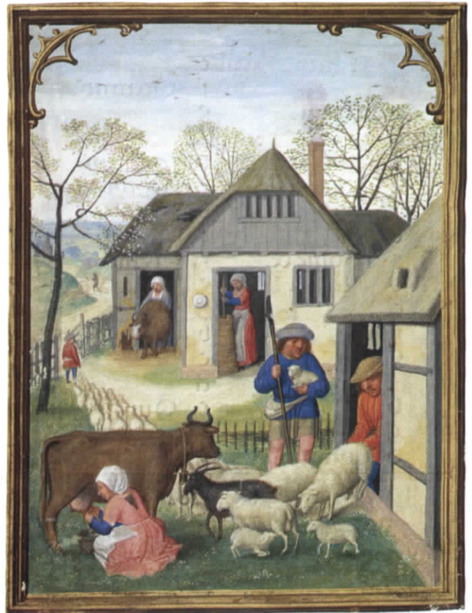
Peasants' homes were small and crowded with people and animals.

Peasants ate vegetables, meat such as pork, and dark, coarse bread made of wheat mixed with rye or oatmeal. During the winter, they ate meat and fish that had been preserved in salt. Herbs were used widely, in part for flavor and in part to lessen the taste of the salt or to disguise the taste of meat that was no longer fresh.