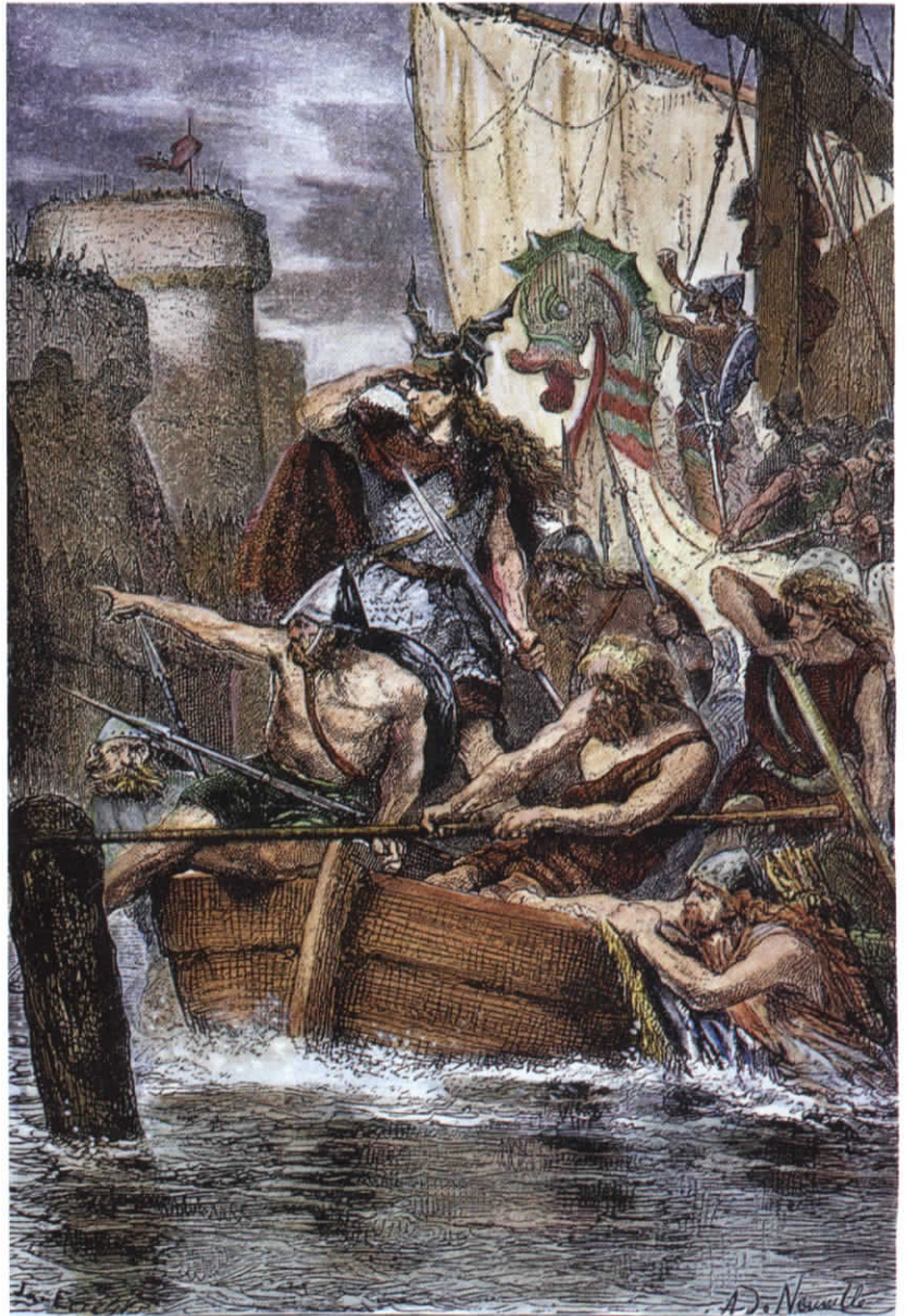
A fleet of Viking ships attacked the walled city of Paris in 885 C.E.

Clearly, the people of western Europe needed ways to defend themselves. To protect themselves and their property, they gradually developed the system we call feudalism . Let’s find out how it worked.