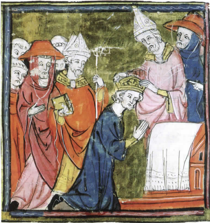
In 800 C.E., Charlemagne was crowned Holy Roman emperor by Pope Leo III.

Charlemagne's Empire One powerful group during this time was the Franks (from whom modern-day France takes its name). The Franks were successful because they had developed a new style of warfare. It depended on troops of