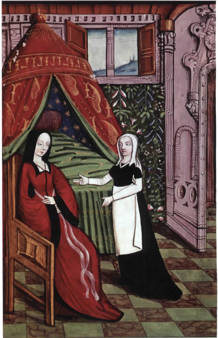
A lady had servants to help her with her personal needs as well as the care of her large household.

Although nobles and monarchs had the most privileged life in medieval times, their lives were not always easy or comfortable. Lit only by candles and warmed by open fires, manor homes and castles could be gloomy and cold. There was little or no privacy. Fleas and lice infected all medieval buildings. People generally bathed only once a week, if that. Clothes were not washed daily either. Diseases affected the rich as well as the poor. And, of course, war was a great and ever-present danger.