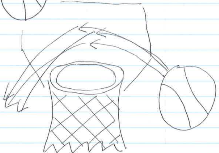
precise but not accurate