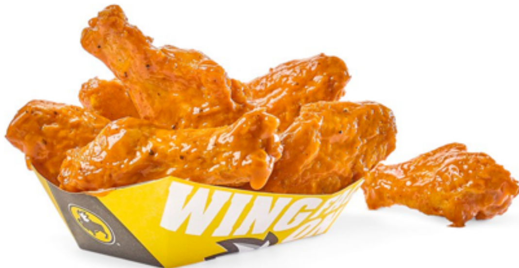
Buffalo Wild Wings

I love all kinds of food but my favorite foods are pickles (especially fried), cheese burgers, and fried chicken or chicken wings. I love Buffalo Wild Wings, and Five Guys they are some of my favorite restaurants to go get chicken wings and burgers.