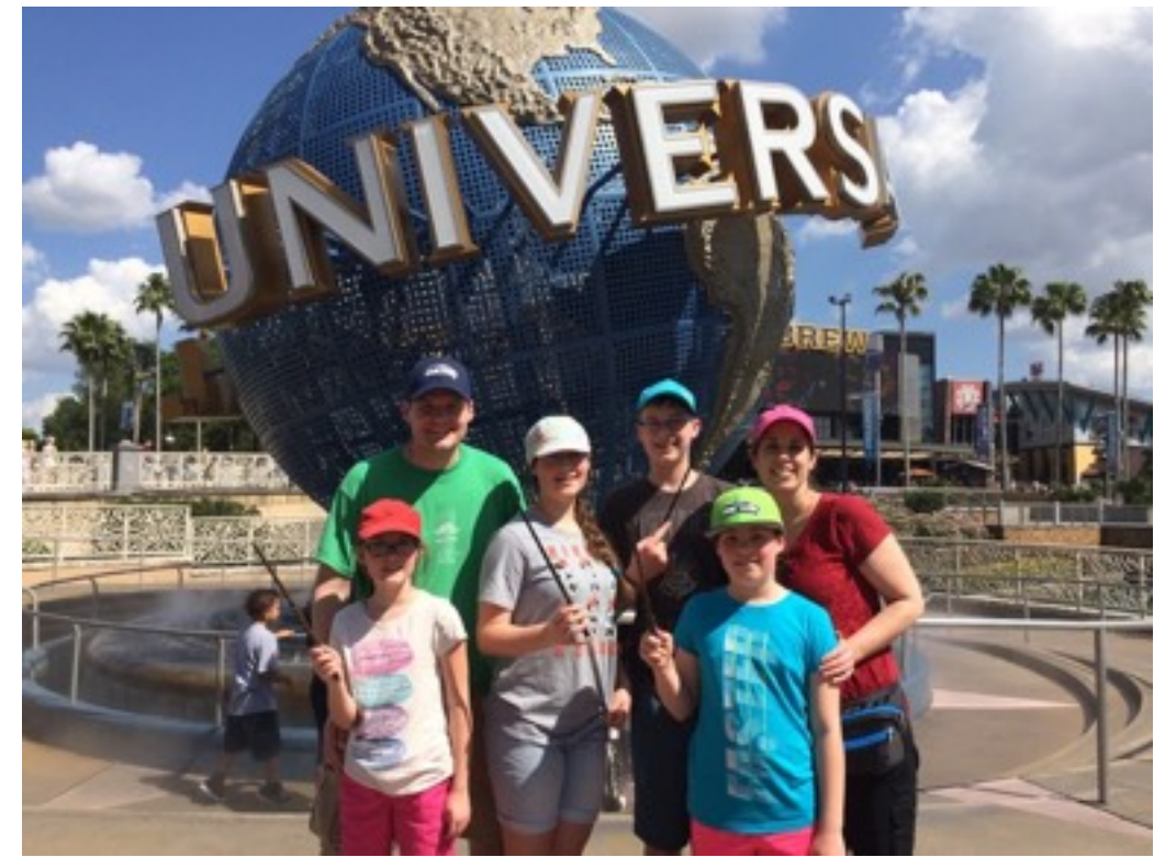
Me and my family at Universal Studios in Florida.