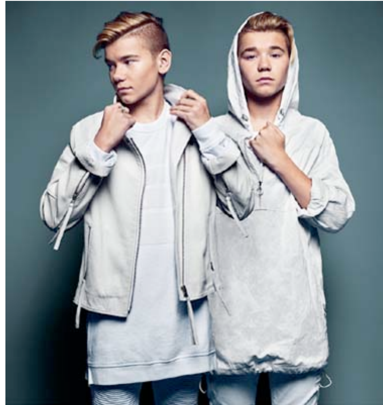
Marcus and Martinus.