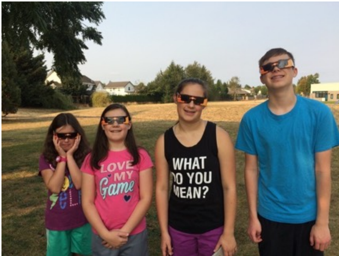
This is me and my siblings during the Eclipse.