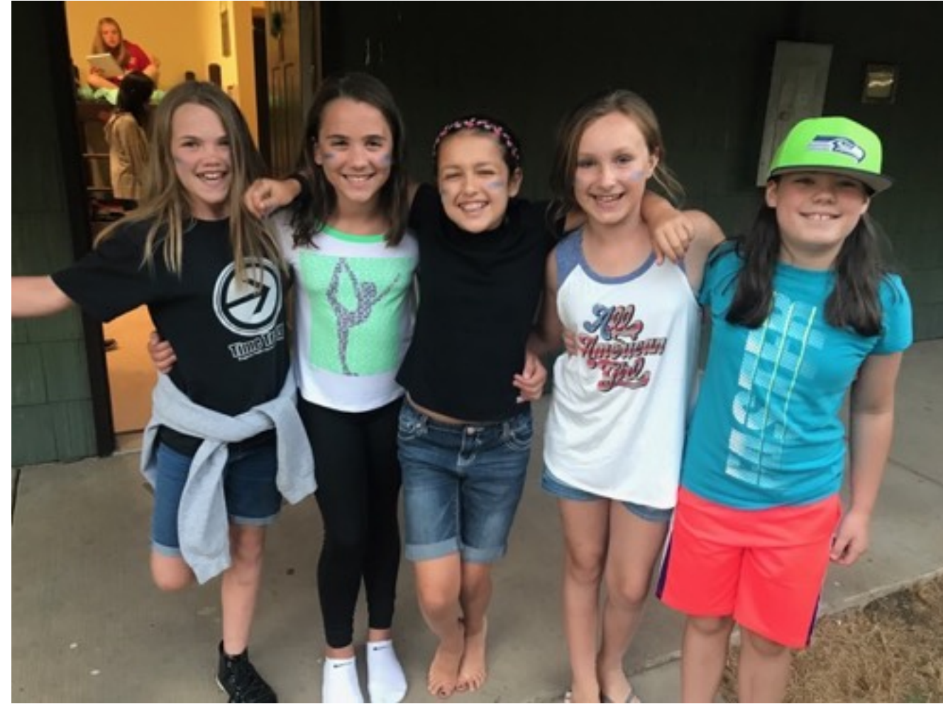
This is me and my friends during my first year at Camp Harlow.