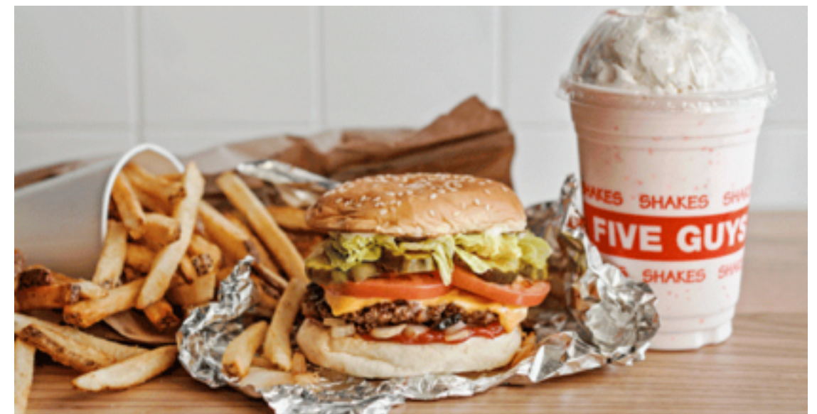
Five Guys Burger