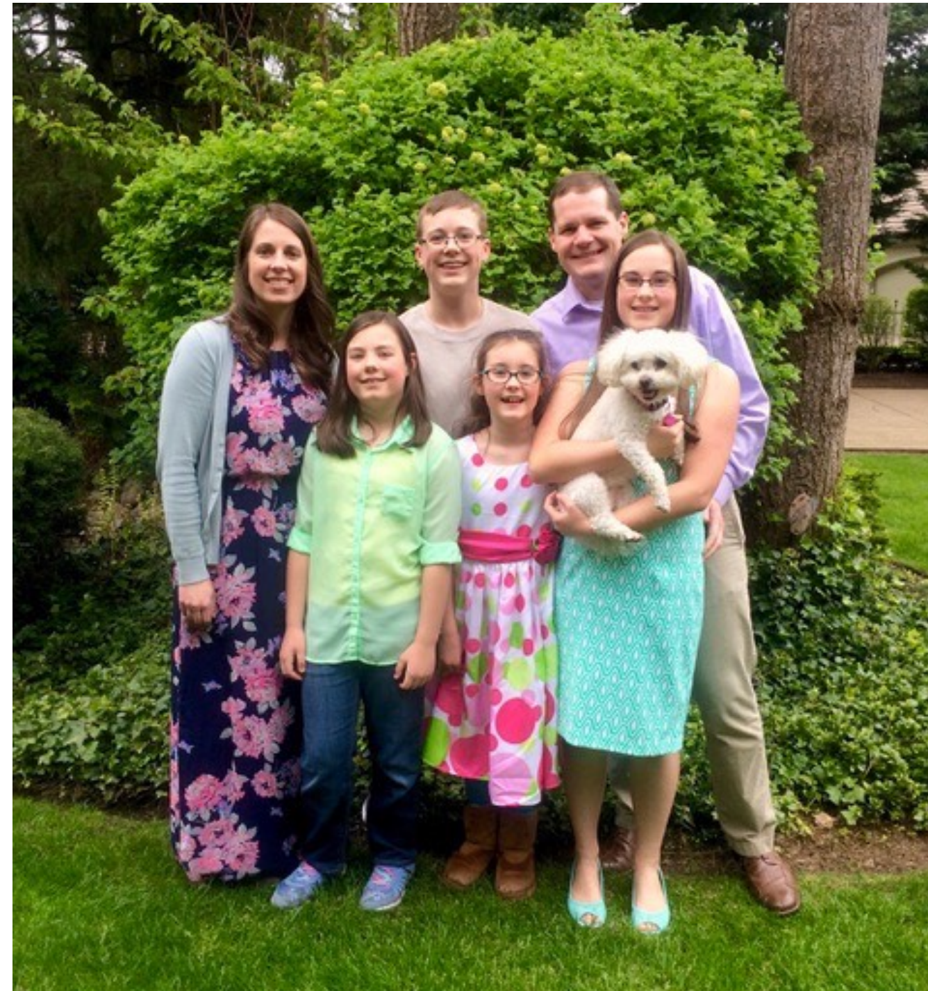
This is me and my family on Easter Sunday a year or two ago.