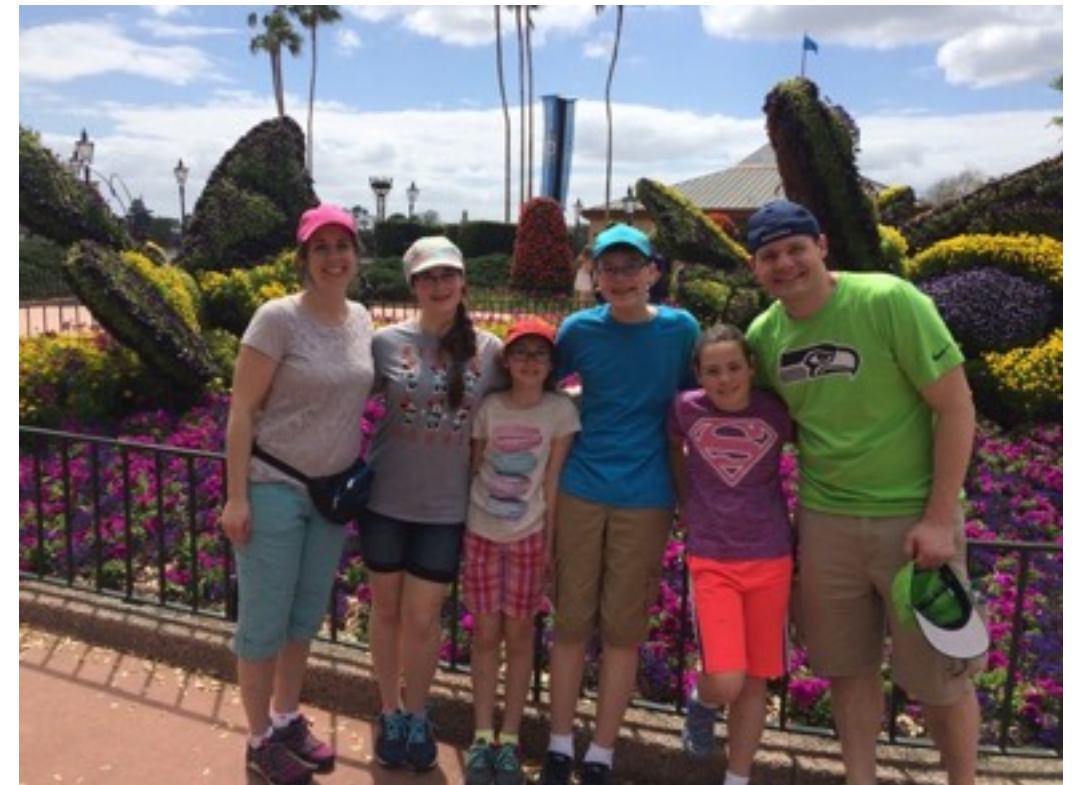
Me and my family at Disney World in Florida.