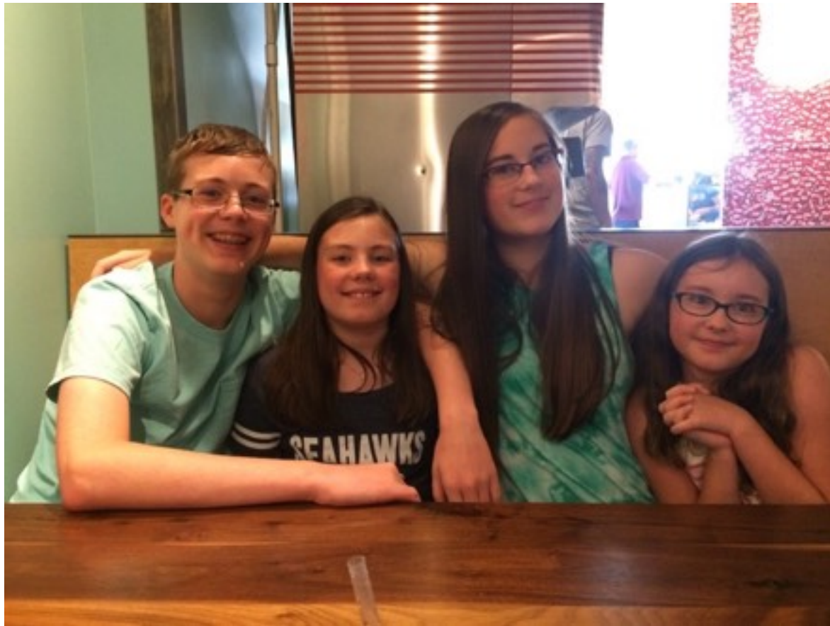
Me and my siblings at MOD on my birthday.

In this chapter you will learn about my family, my pets, and the schools that I went to or the one I'm currently at.