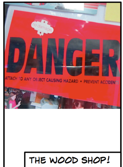
THE WOOD SHOP!