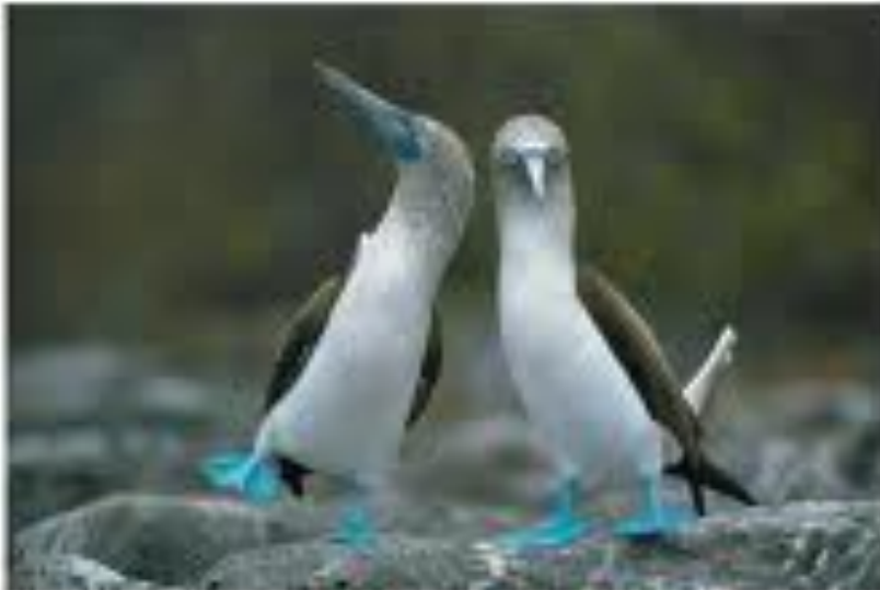
(a) Courting dance