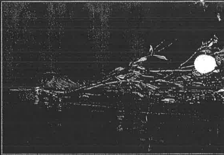
BEAVERS have been lured back to the park by lush vegetation, especially booth willows. The animals have built ponds that encourage still more vegetation to grow and have altered the course of some streams.

ters are hard, elk take a lot of chances to put something in their belly. Give me two hard winters in a row, and I'll buy the argument."