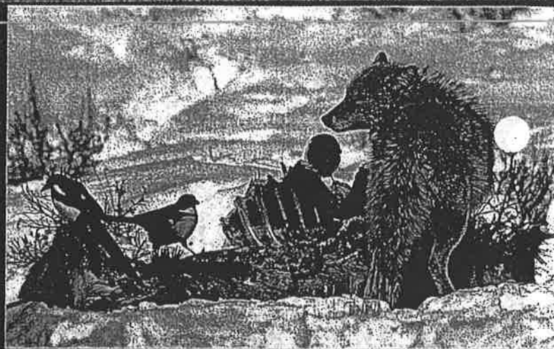
COYOTE AND MAGPIES feed on an elk calf killed by wolves. These animals, usually joined by ravens, often scavenge the remains of wolf kills, bringing to mind the classic progression on the African savanna of lion, hyena and vulture.