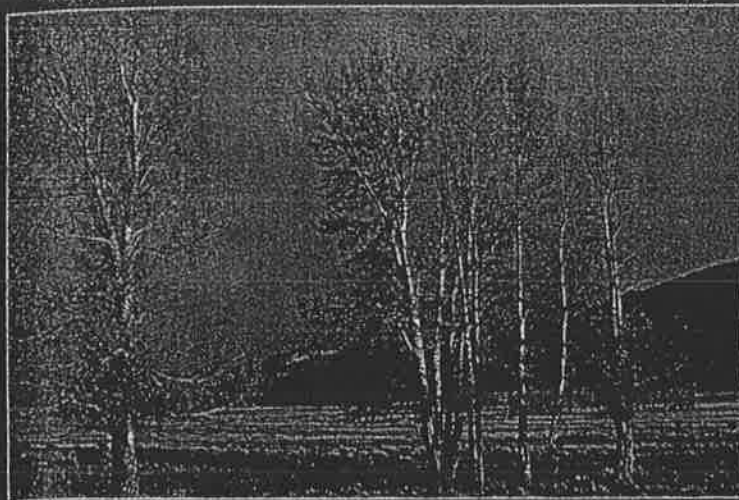
VEGETATION in the park is rebounding because of decreasing numbers of elk. These mature cottonwood trees are now reinforced by seedlings and saplings that, without the overabundant elk, can grow to maturity.