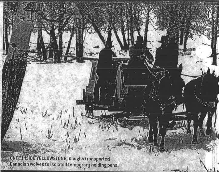
ONCE INSIDE YELLOWSTONE, sleighs transported Canadian wolves to isolated temporary holding pens.

Trees are coming back most dramatically in places where a browsing elk doesn't have a 360-degree view; these willows, for example, sit below a rise that blocks the animals' view. A look at the plants shows they have not been browsed at all in several years. Elk don't feel safe here, Ripple contends, because they can't see what is going on all around and are nervous about spending time in this vicinity. Just 50 meters away, however, where the terrain is level and wide open and the elk enjoy a panoramic view, the willows are less than a meter tall and have been browsed much more heavily