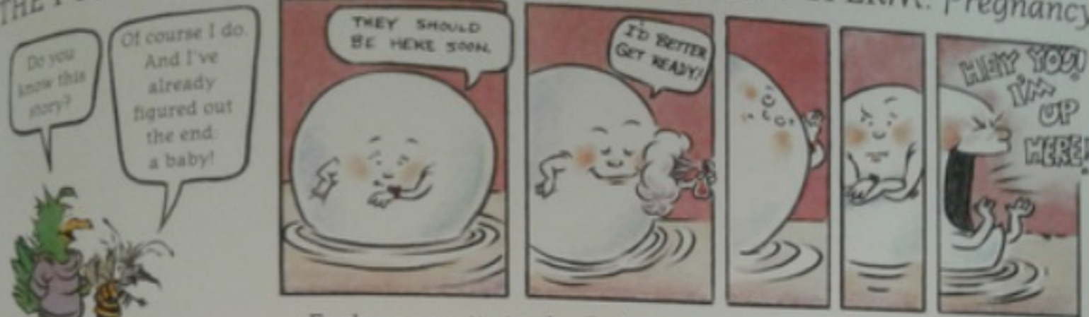
Each egg waits in the Fallopian tube to be fertilized by a sperm.