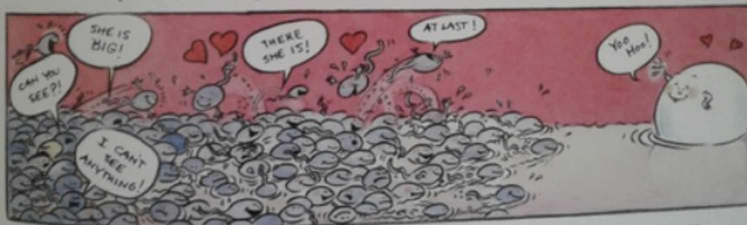
and into a Fallopian tube, where an egg may be waiting to unite with a sperm.