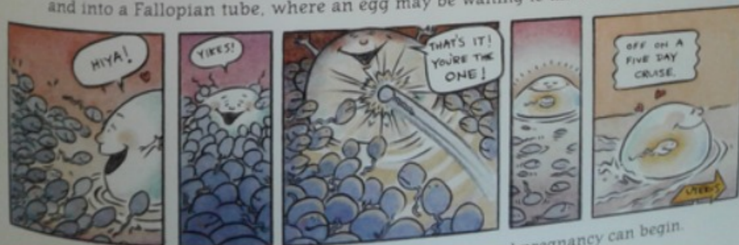
Pregnancy can begin.