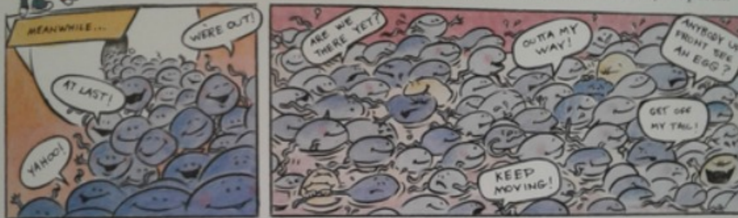
Sperm leave the penis, swim up the vagina, through the uterus,