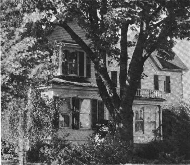
The Walton House located at 433 E. Broadway, Eugene, was built in 1868. Now serves as rental property.