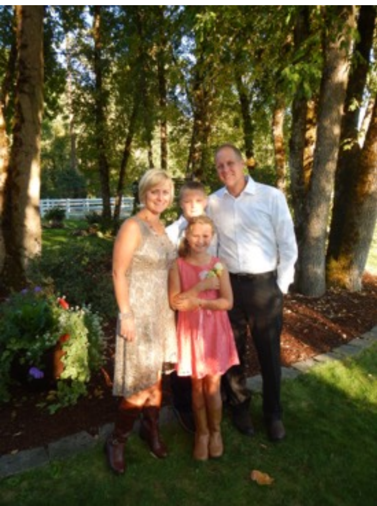
THIS IS AT A WEDDING A COUPLE SUMMERS AGO. MY MOMS ON THE LEFT, MY BROTHERS IN THE BACK, I'M IN THE FRONT, AND MY DADS ON THE RIGHT.