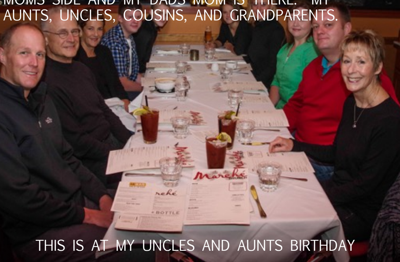
THIS IS AT MY UNCLAS AND AUNTS BIRTHDAY