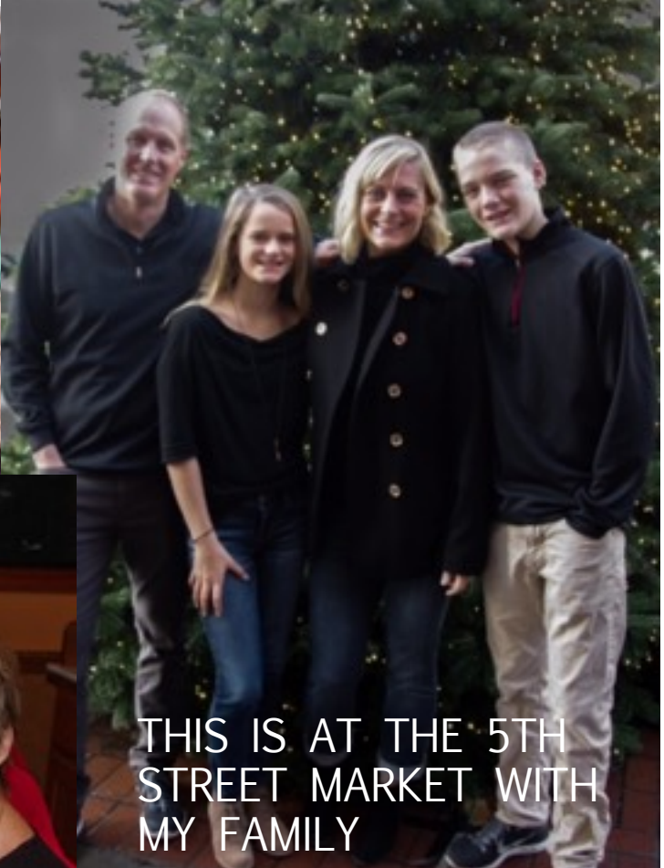
THIS IS AT THE 5TH STREET MARKET WITH MY FAMILY